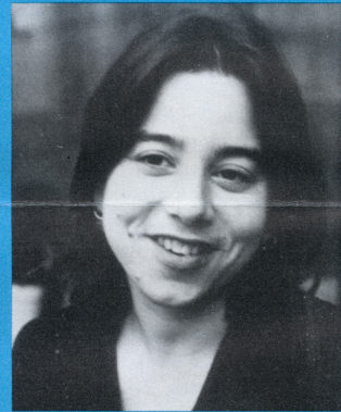
Lucinda Roy ♦ Charlotte Watson Sherman ♦ Sarah Schulman