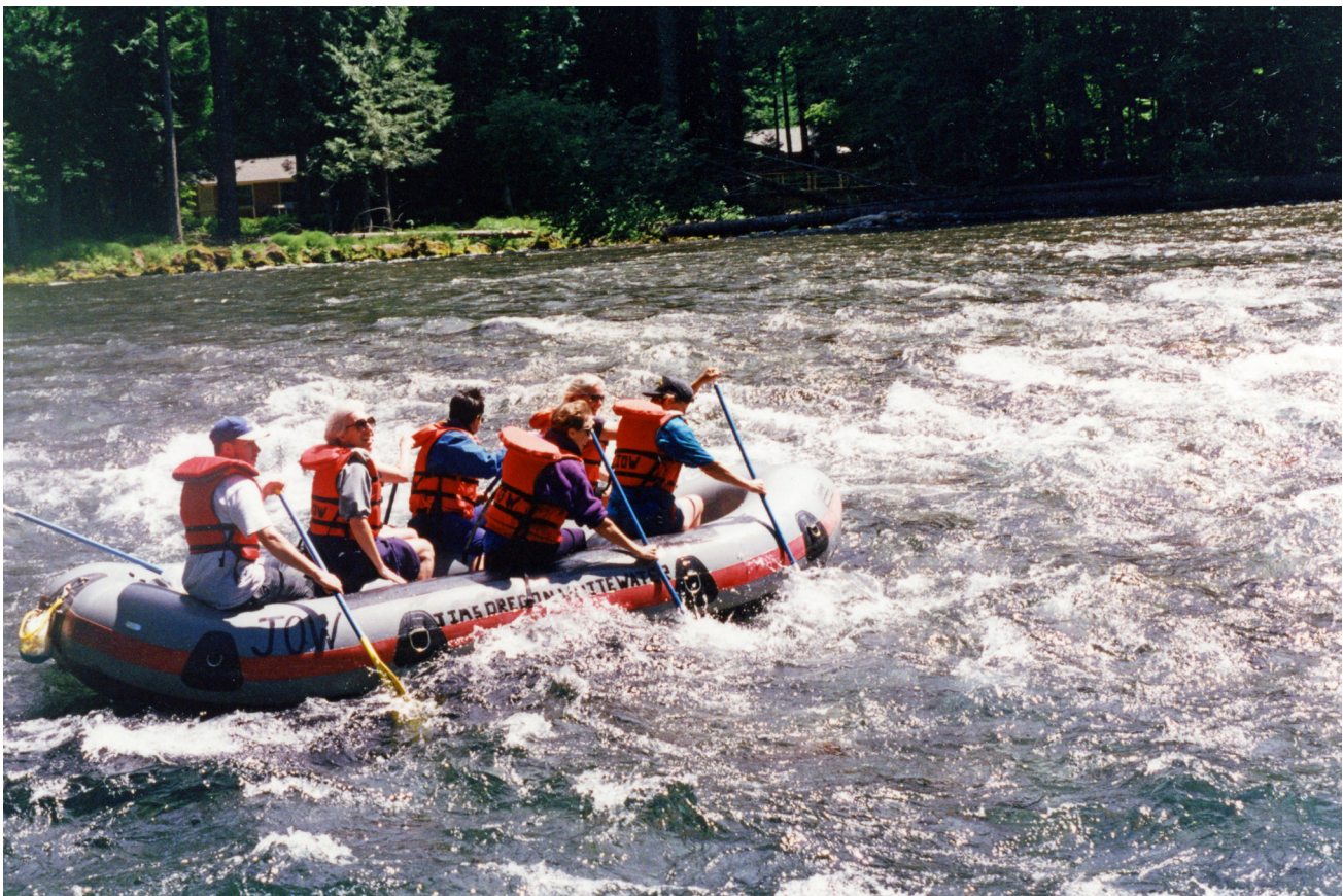
Participants rafting the McKenzie River with a guide, 1997