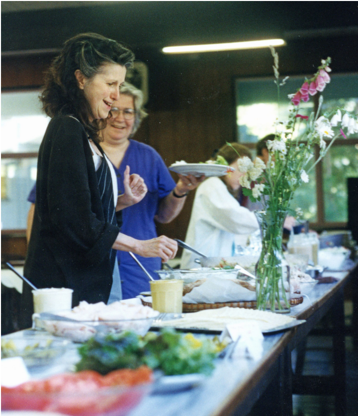
Participants at the lunch buffet, 1997