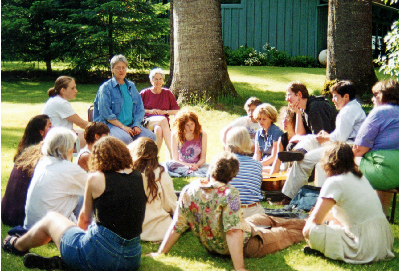
Afternoon discussion group, 1997