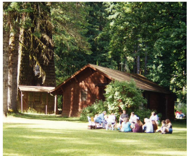
Below: Ad hoc critique group meeting on the lawn, 1997