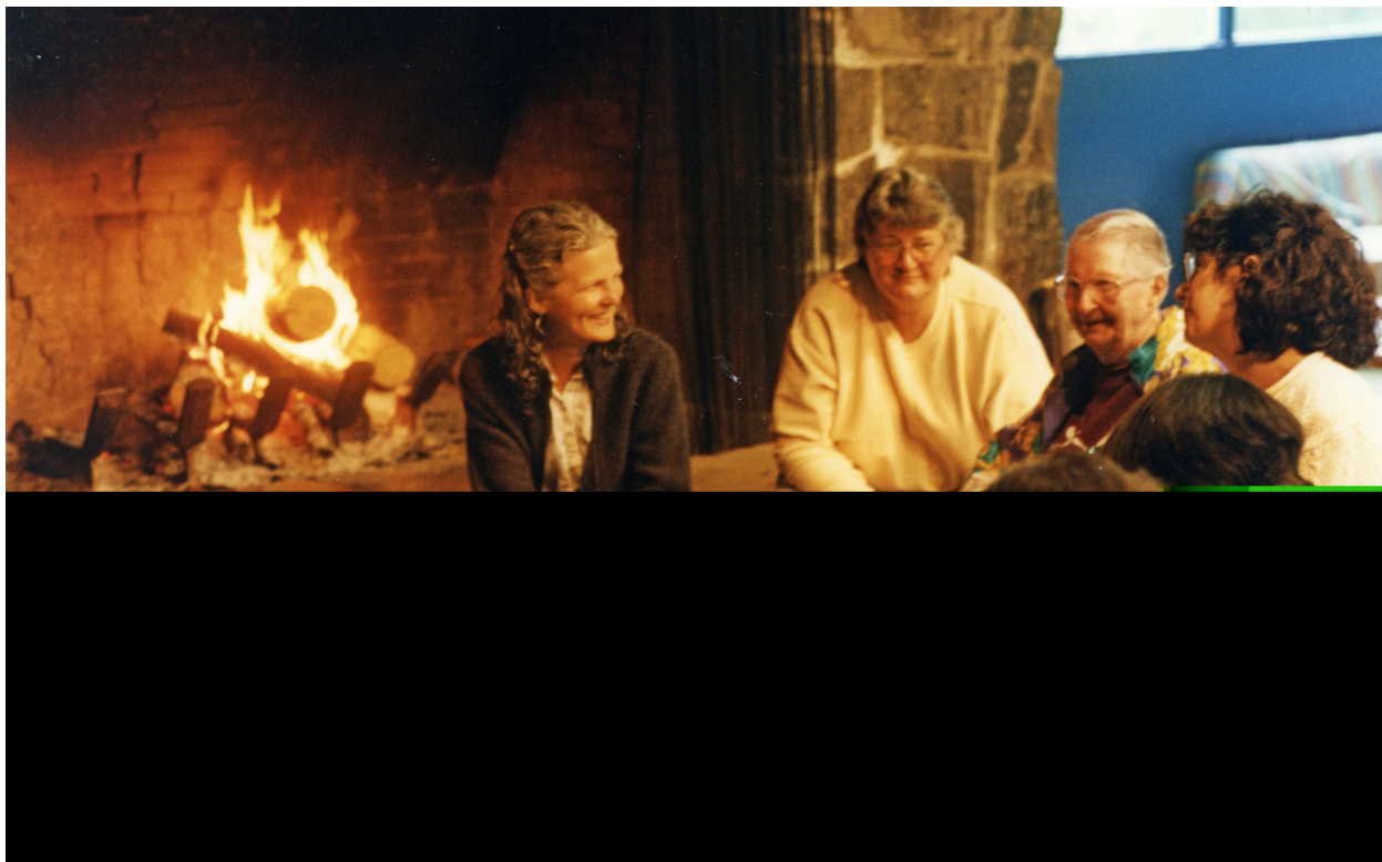
Class meeting in the lodge on a cool summer morning, 1997