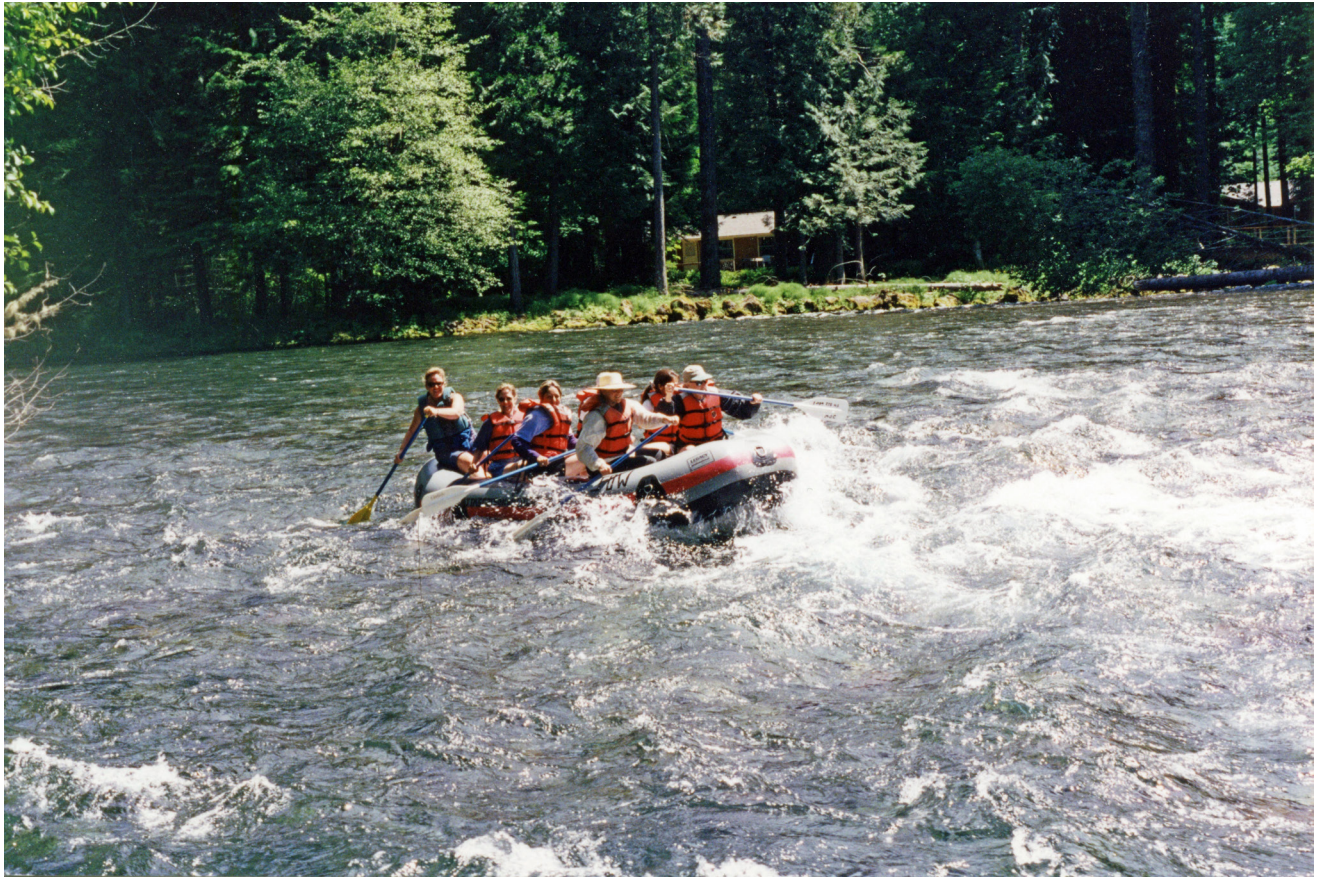
Participants rafting the McKenzie River with a guide, 1997