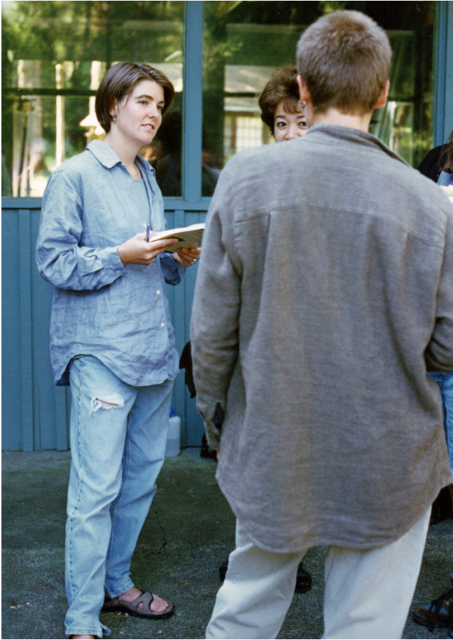
Participants conversing on the terrace, 1997