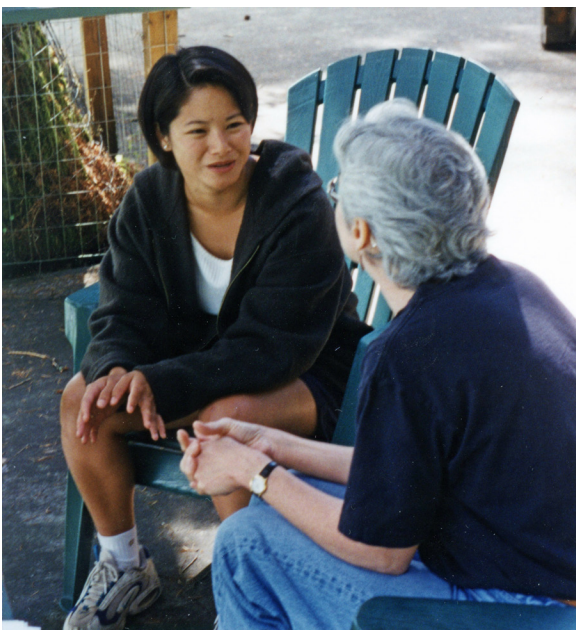
Above left: Participant, 1997