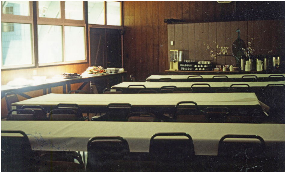
Left: Dining room in the late afternoon, with snacks and drinks, 1997